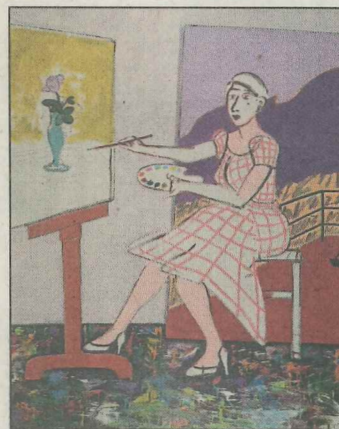
"Self-Portrait" (1977) by Joan Brown.

"We have a few artworks by Joan Brown in our collection, but nothing from this period of time," said curator of con